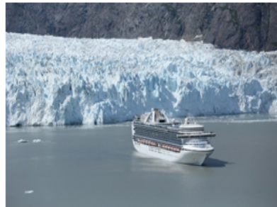
Travel Leaders Group's travel advisers frequently recommend Alaska as a not-to-be-missed travel experience. Here, a Princess Cruises ship in Glacier Bay

Alaska cruises jumped to the top spot from last year's fifth place to become the most booked domestic vacation for 2018, according to findings from Travel Leaders Group's 2018 Travel Trends Survey.